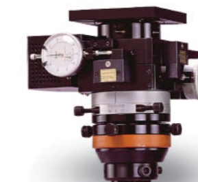
• Orbit cut