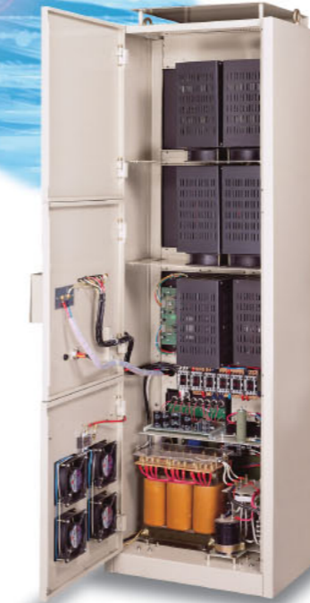
MH SERIES: • Back side