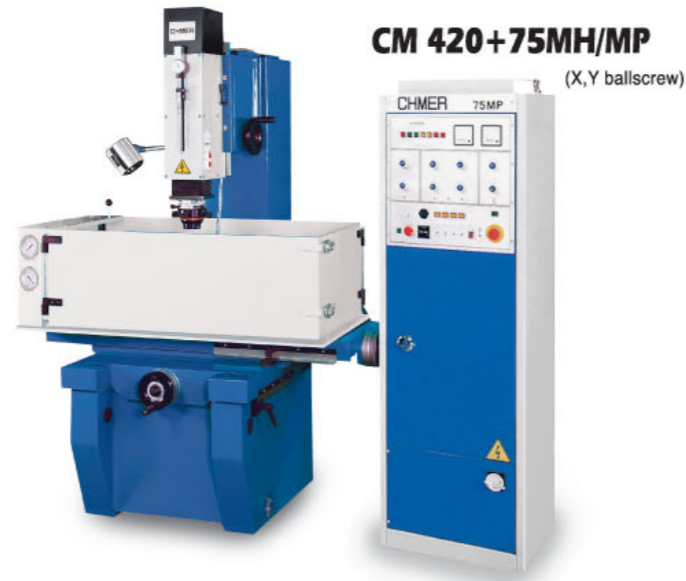
CM 420+75MH/MP (X,Y ballscrew)