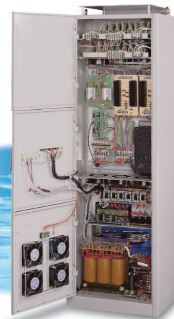
MP SERIES: • Back side