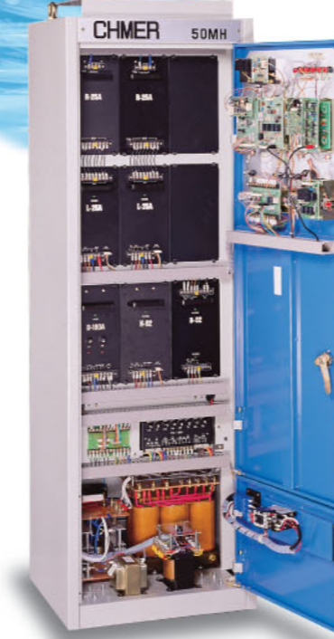
MH SERIES: • Front view