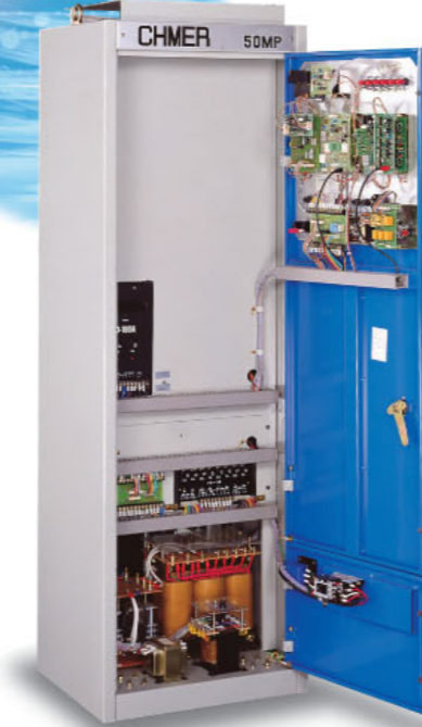
MP SERIES: • Front view